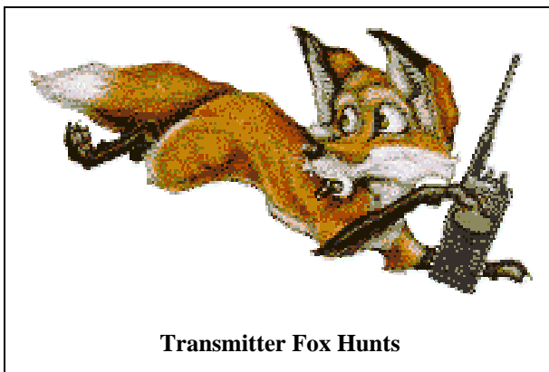
Transmitter Fox Hunts