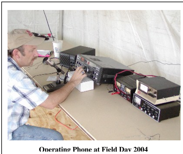
Operating Phone at Field Day 2004

Truly special Amateur Radio clubs are well balanced in their programs for serving the community, developing club members' Amateur Radio skills and social activities, striving each year to build on their successes to improve their effectiveness. So, what does SARA do that makes the club an SSC?