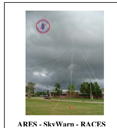
ARES - SkvWarn - RACES